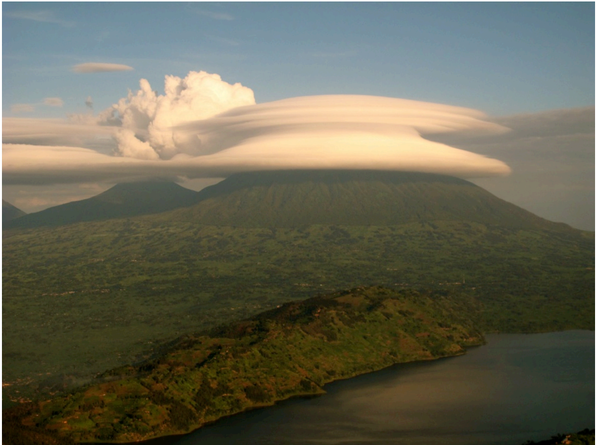
Rwanda, "The Land of a Thousand Hills"

The Rising From Ashes Foundation has been formed in response to the overwhelming support from around the world and our desire to bring the message of hope to as many people as possible. Our goal is to use the Rising From Ashes documentary feature film as the core messaging tool to build out a global movement around the bike for peace, reconciliation, and life transformation.