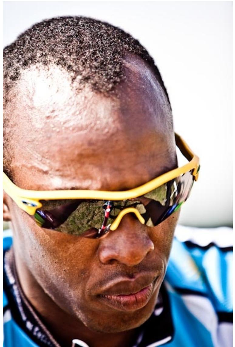
Adrien Niyonshuti in London